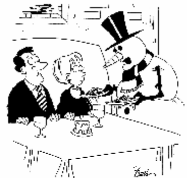
"Careful! The plates are extremely cold!"