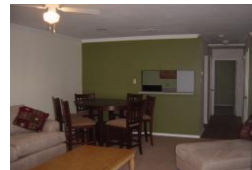
Floorplan B - Living and Dining Room