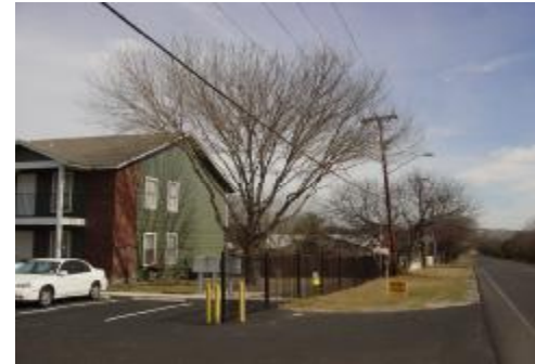
Street Scene and Building 1