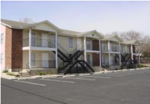
Building 3 - Units 301 to 308

Call (800) 886-0336 x 7 for more information