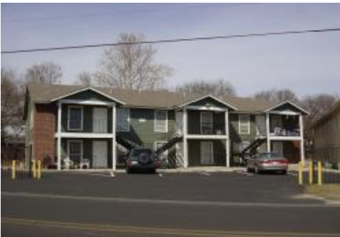
Building 4 - Units 401 to 406