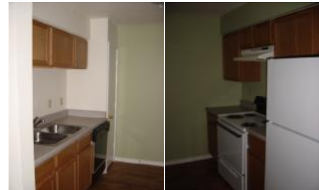
Typical Kitchen Interior