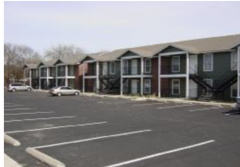
Building 1 and 2 - Units 101 to 206