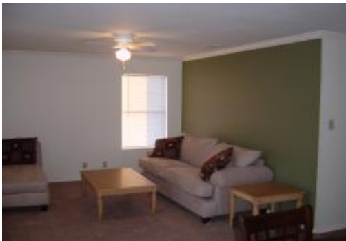
Floorplan A - Living Room