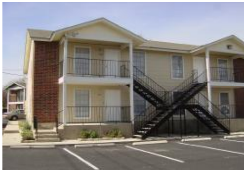
Building 3 - Units 301, 302, 305, 306