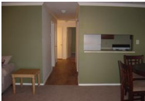
Floorplan A - Dining Room and Hall